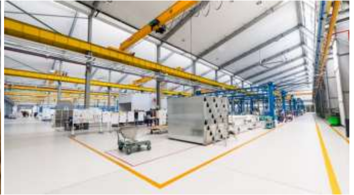
INNOVATION FACTORIES AND SYSTEMS