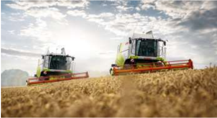
AGRO CULTURE SECTORE